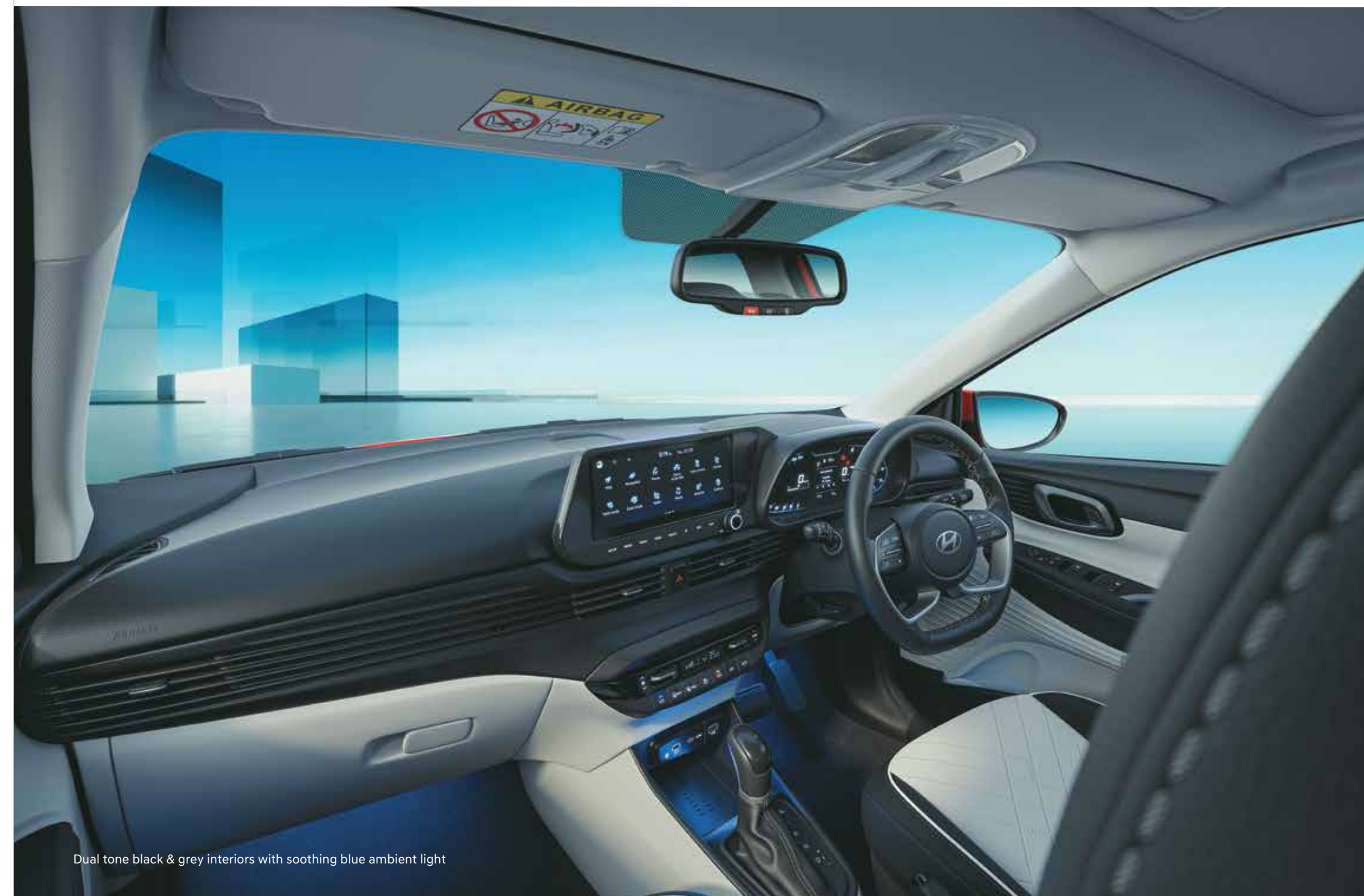
Dual tone black & grey interiors with soothing blue ambient light

The interiors of the new Hyundai i20 mesmerize. Dual tone seats that look fabulous and enough space to lounge out in comfort. Ambient lighting that uplifts your mood and sliding front armrest that provides a more convenient way to relax.