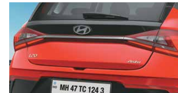
Stylish Z-shaped LED tail lamps