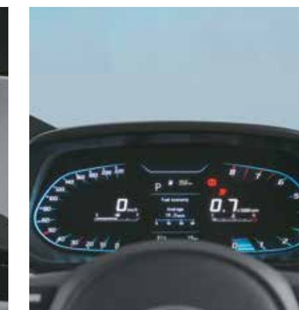
Digital cluster with TFT multi information display

Other features: Superior leg room and thigh support | Sliding front armrest | Leather wrapped steering wheel and gear knob | Metal finish inside door handles