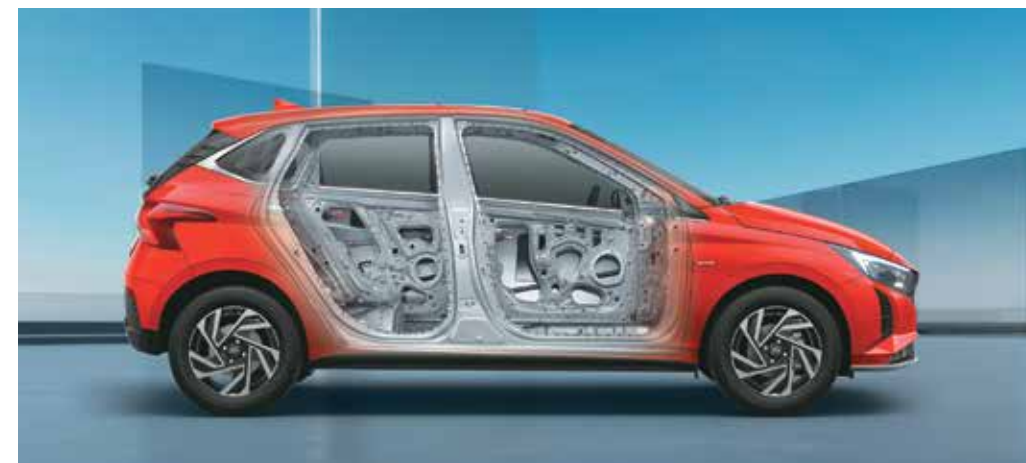
Strong body structure (with AHSS and HSS)