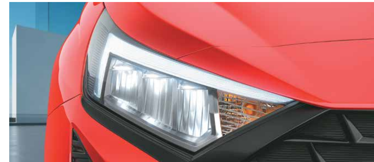
LED headlamps with signature DRLs

The new Hyundai i20 has it all. A sensuous sporty design, a majestic new grille and lights that are a showstopper. Turn heads as you whizz by on those alloy wheels and make an impression with the chrome lines. It's simply stunning from tip to toe.