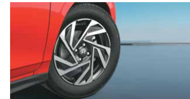
R16 (D=405.6 mm) diamond cut alloy wheels