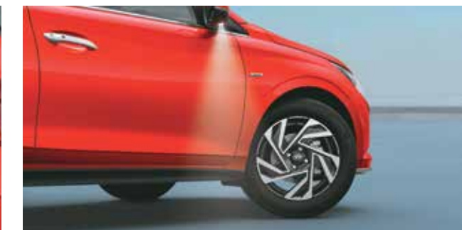
Puddle lamps with welcome function

Other features: Chrome outside door handles | Turn indicators on outside mirrors Painted black finish side sill garnish with i20 branding | Shark fin antenna