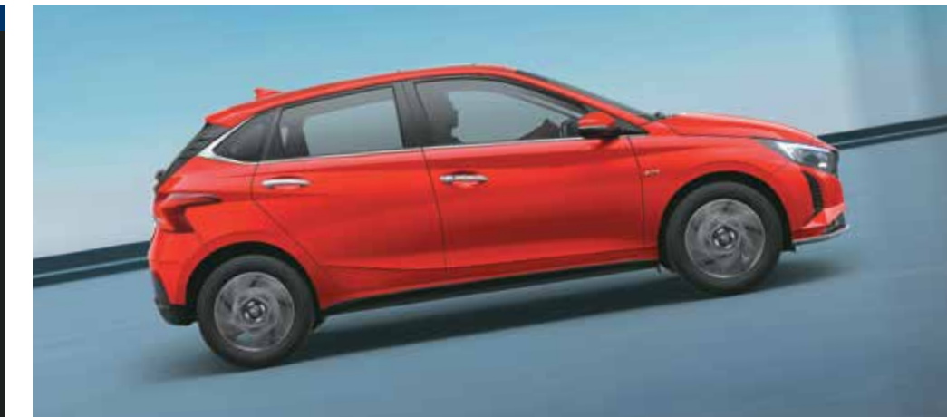
Hill-start assist control (HAC)