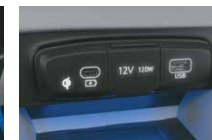
Fast USB charging (Type C)