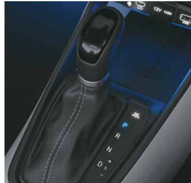
Intelligent variable transmission (IVT)