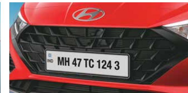
Parametric jewel pattern grille