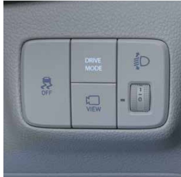
Drive mode select