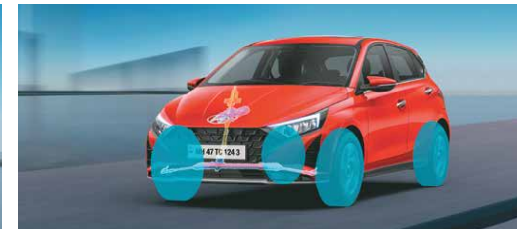
Electronic stability control (ESC) with vehicle stability management (VSM)

Other features: Impact sensing auto door unlock | Speed sensing auto door lock | Automatic headlamps | Burglar alarm | Driver rear view monitor (DRVM) | Emergency stop signal (1 st in segment) | 3-point seat belt & seat belt reminder (all seats) | Rear camera with dynamic guidelines | ISOFIX (standard)