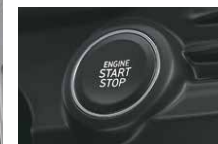
Push button start/stop