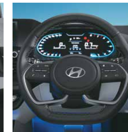
Leather wrapped D-cut steering