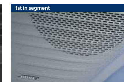
Bose premium 7 speaker system

Other features: 60+ Bluelink connected features (Best in segment) | Multi-language UI support (12 nos.) (1 st in segment) | OTA updates for infotainment and map (1 st in segment) | Home to car (H2C) with Alexa (English & Hindi) | Cruise control | Rear AC vents | Multi phone bluetooth connectivity (1 st in segment)