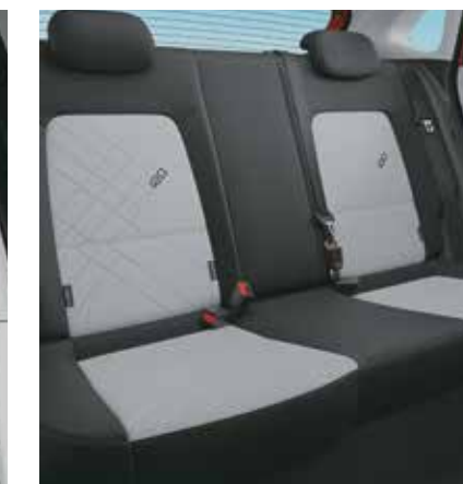
Spacious interiors with ample headroom, legroom and shoulder room