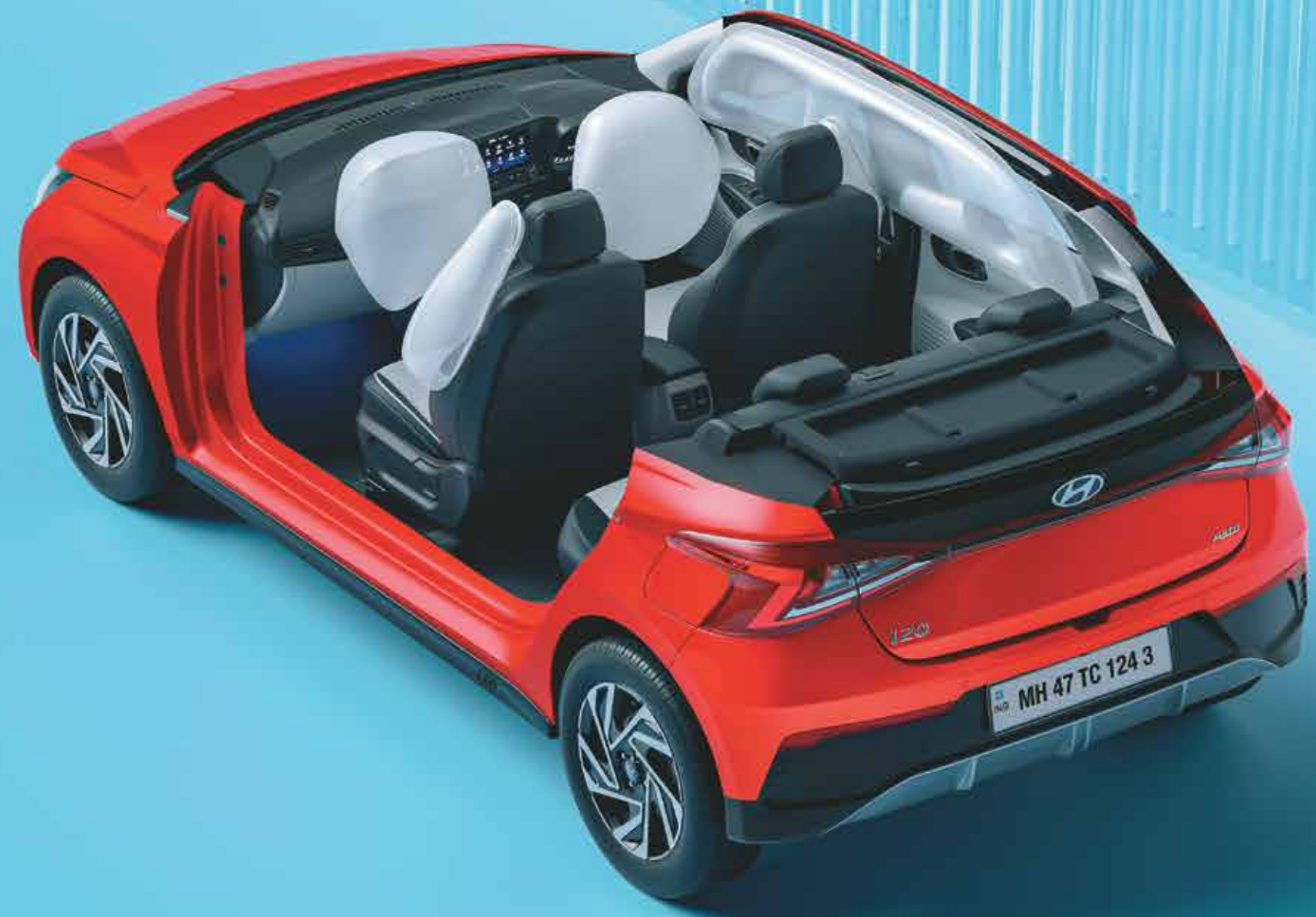
6 airbags standard (Best in segment)