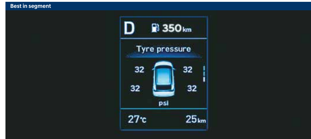
Tyre pressure monitoring system (highline) with display on MID