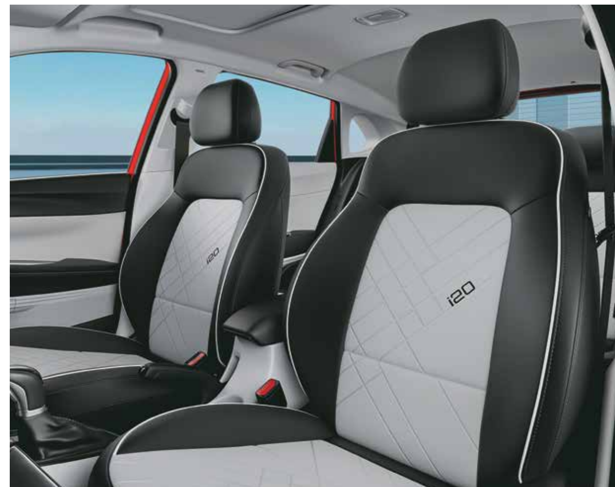
Dual tone seats with i20 branding