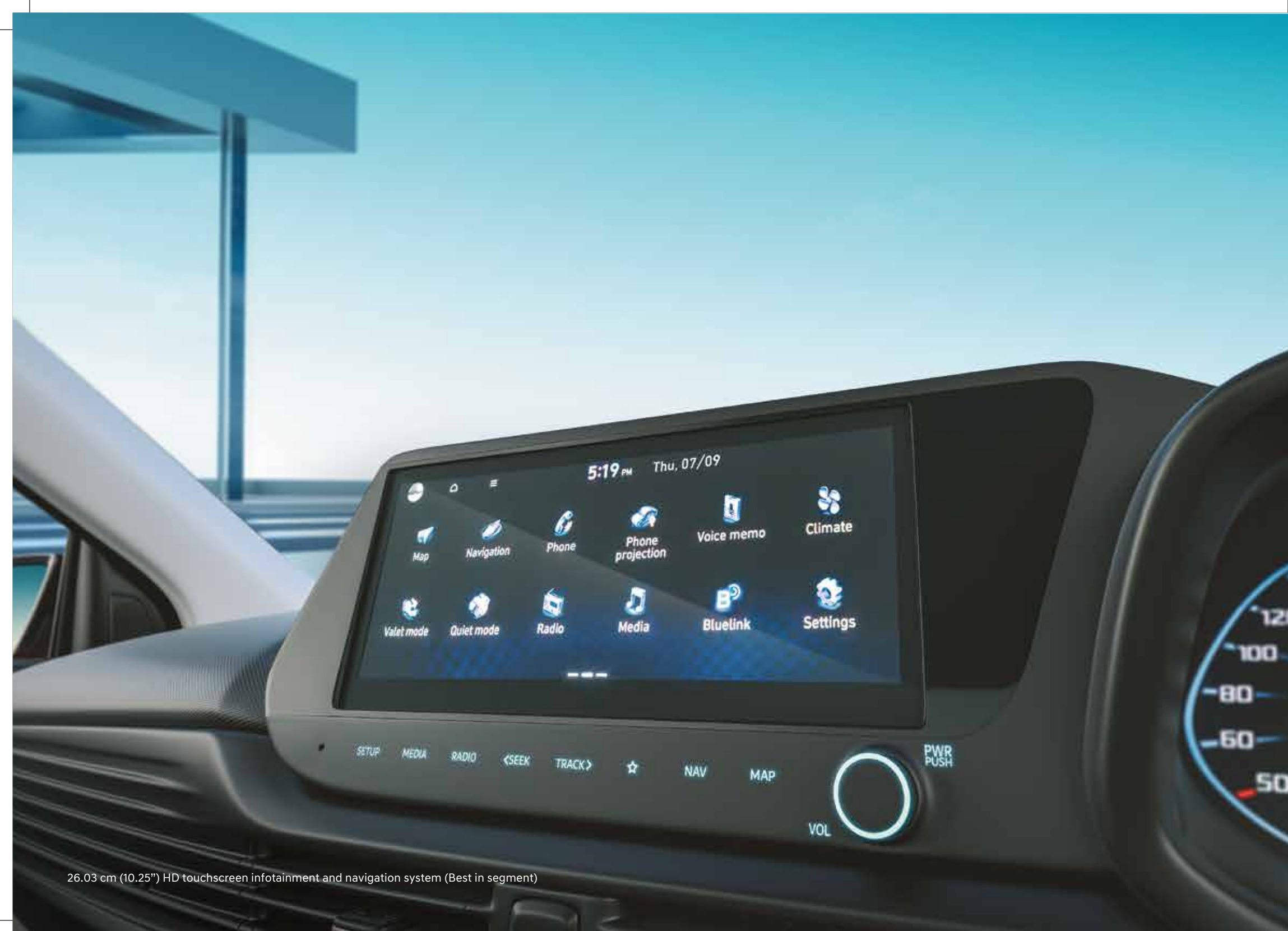
26.03 cm (10.25") HD touchscreen infotainment and navigation system (Best in segment)