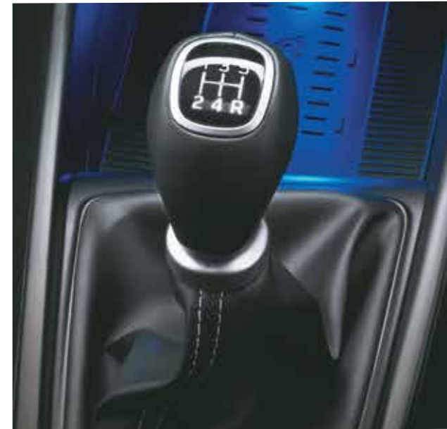
5 speed manual transmission