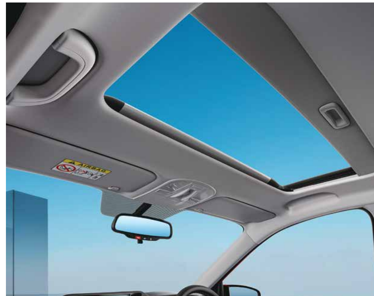
Voice enabled smart electric sunroof