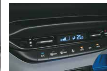
Fully automatic temperature control (FATC)